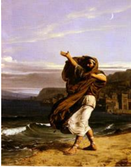
Demosthenes Practising Oratory (1870)