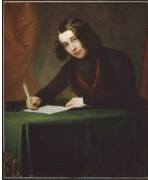
Charles Dickens (1842)